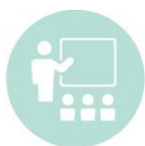
Premium school with small class sizes and generous non-contact time

Wellington College China has been awarded the HR Asia ‘Best Companies to Work for in Asia’ Award for 3 years running.